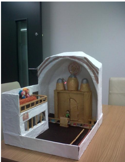
A wonderful model of New London synagogue by Freya in Year 7