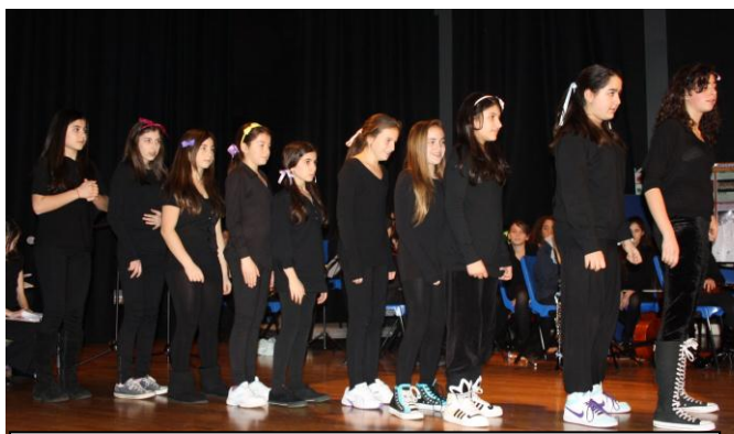
The Chanukah concert was a tremendous event. All the students worked incredibly hard to produce a wonderful evening.